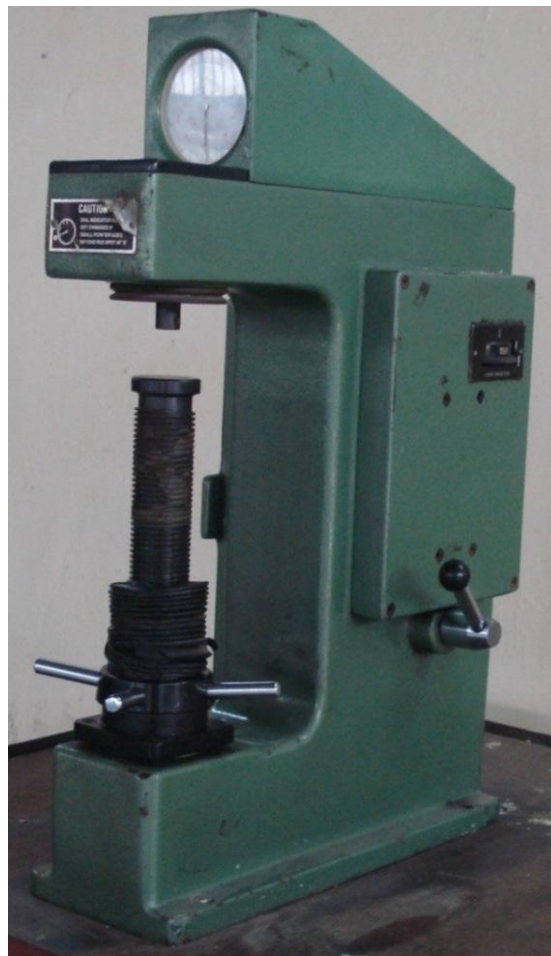
Fig. 1: Rock well hardness test

In present experimental work Rockwell hardness was measured on carburized and tempered mild steel samples which are carburized under different temperature range of 850, 900 and 950 °C. For each of the sample, test was conducted for 5 times and the average of all the samples was taken as the observed values in each case. The Fig.1 shows the Rockwell hardness test.